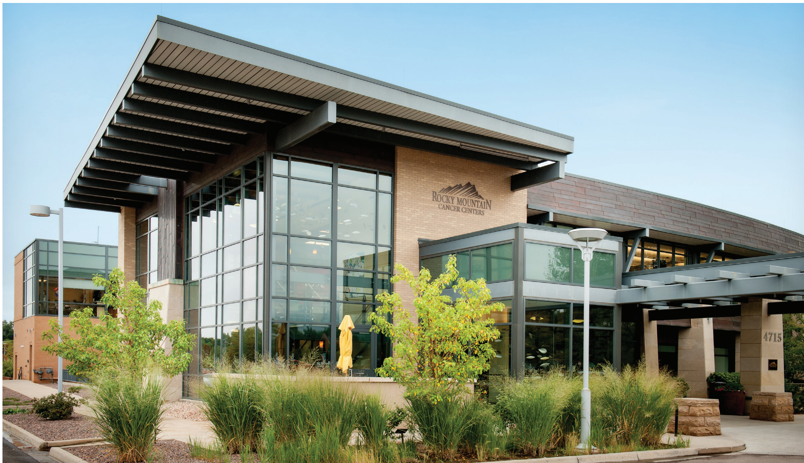
Colorado's largest cancer care provider, Rocky Mountain Cancer Centers, underwent an inventory management makeover in 2012 to improve efficiency.